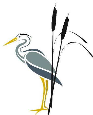
Rush Green Primary