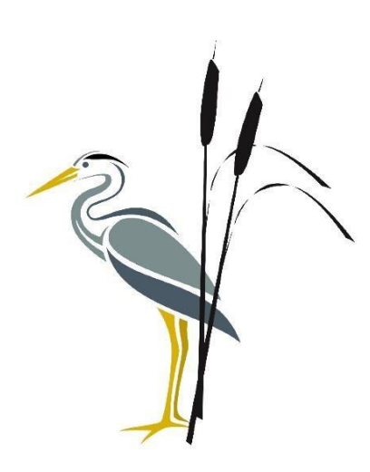
Rush Green Primary